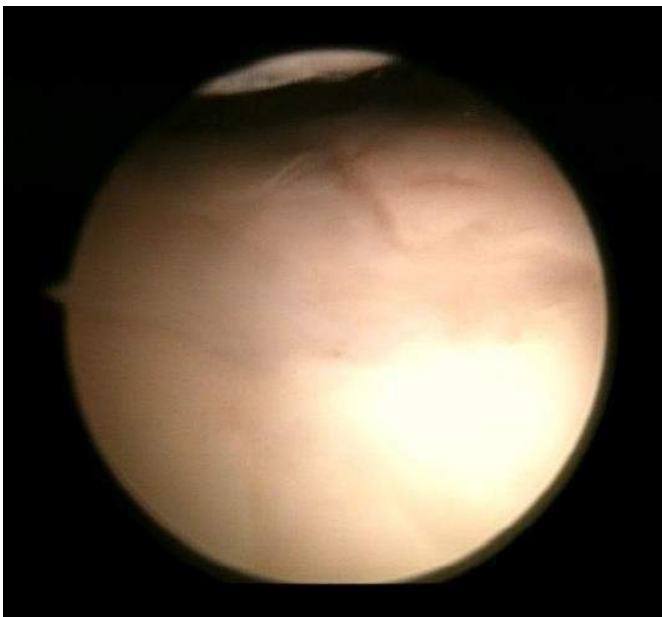
Il look a distanza di 1 anno